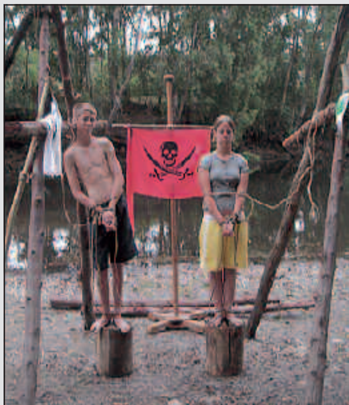
Hazards of volunteering! Volunteers at the Q&A Challenge

Ultimately, all the Survivors enjoyed Survivor 2 immensely. It was a well planned and well-executed event thanks to the Scouters, Scouts and of course the Parents.